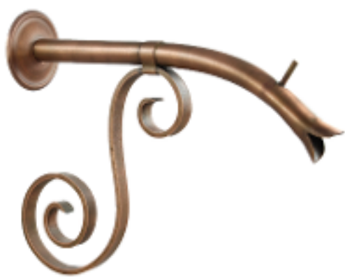
Large Courtyard Spout with Florentine in Brushed Copper