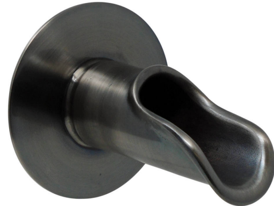
Roman Scupper with Round Back Plate in Brushed Pewter