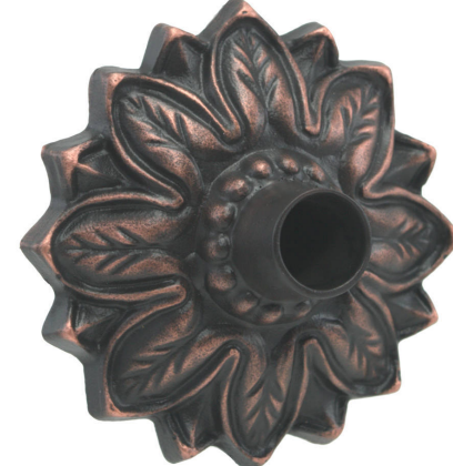
Large Nikila Emitter in Distressed Copper

For a complete version of the Catalog, Additional Pictures, and other Resources, please visit BlackOakFoundry.com/Resources-and-Tools