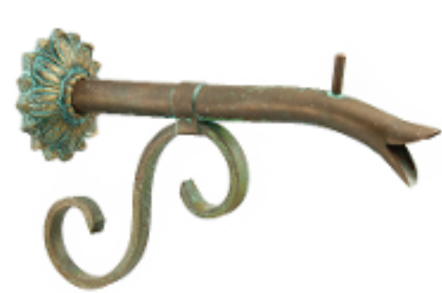
Small Courtyard Spout with Nikila in Sealed Verde

Handmade spouts feature a copper construction with a scroll forming the support. Scroll and support are secured with a copper strap and the entire assembly is blazed and soldered with food and water safe materials. Connection is solid brass, threaded in 1/2" NPT for the small spouts and 3/4" NPT for the large spouts.