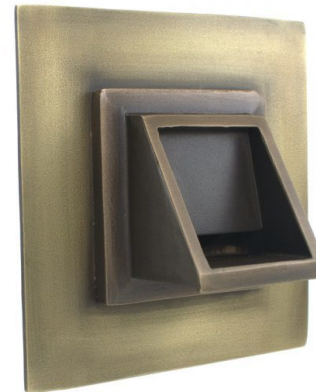
Short Square Scupper with Square Back Plate in Antique Brass American aka 'Old'