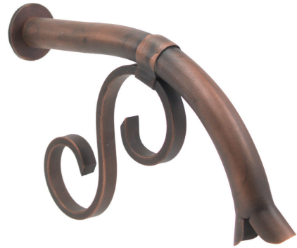
Small Droop Spout with Mini Back Plate in Distressed Copper