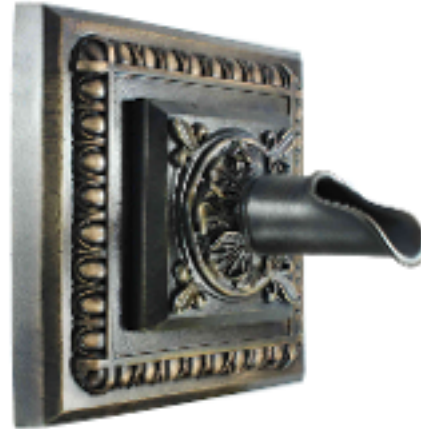
Oak Leaf Scupper with Apollo Back Plate Square in Oil Rubbed Bronze