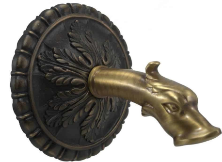
Verona Spout - Large in Oil Rubbed Bronze Back Plate with Conservative Highlight and Antique Brass Duck Spout

Crafted in Italy, our authentic Italian spouts feature solid brass construction and the quality you have come to expect from Black Oak Foundry. These spouts are made from 100% solid brass and can be customized in any of our metal finishes.