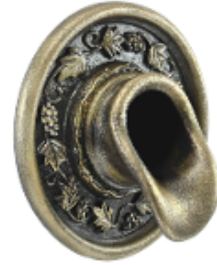
Napa Scupper in Oil Rubbed Bronze with Bold Highlight