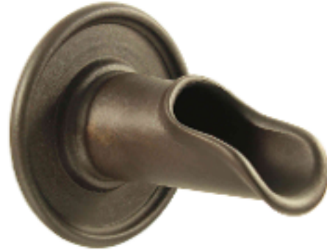
Classic Roman Scupper in Oil Rubbed Bronze

All short and medium length scuppers from Black Oak Foundry feature solid copper, brass and bronze construction featuring food grade solder and brazing materials, allowing for use around your family, pets and fish pond applications.