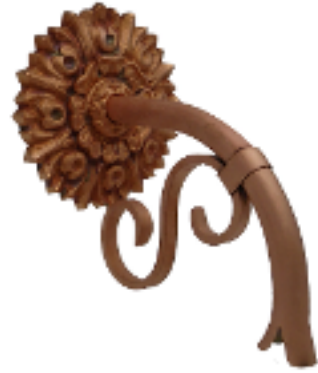
Versailles Spout in Penny Copper