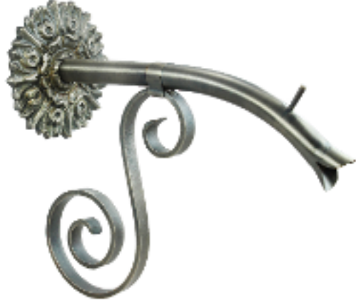
Large Courtyard Spout with Versailles in Brushed Pewter