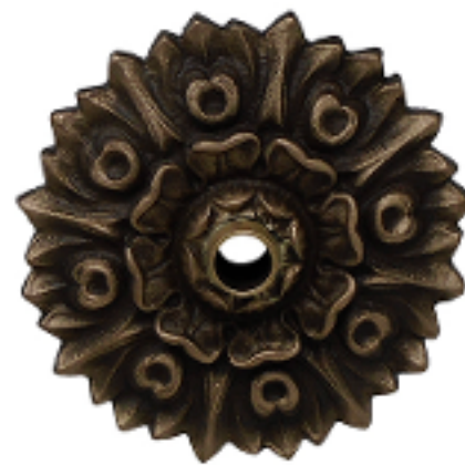
Versailles Emitter in Oil Rubbed Bronze with Bold Highlight

All emitters from Black Oak Foundry feature solid copper, brass, and bronze construction featuring food grade solder and brazing materials, allowing for use around your family, pets and fish pond applications.