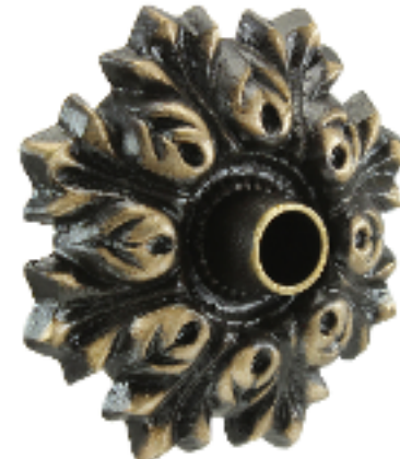
Bordeaux Emitter in Oil Rubbed Bronze with Extreme Highlight