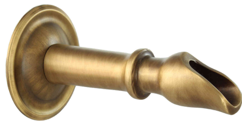
Anzio Spout in Antique Brass

For a complete version of the Catalog, Additional Pictures, and other Resources, please visit BlackOakFoundry.com/Resources-and-Tools