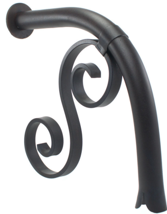
Large Droop Spout with Mini Back Plate in Almost Black