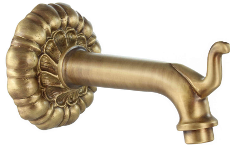
Viareggio Spout Swirl in Antique Brass