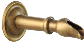
Anzio Spout in Antique Brass