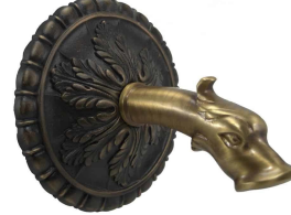
Verona Spout - Large in Oil Rubbed Bronze Back Plate with Antique Brass Duck Spout