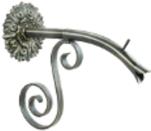
Large Courtyard Spout with Versailles in Brushed Pewter