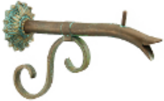
Small Courtyard Spout with Nikila in Sealed Verde

Handmade spouts feature a copper construction with a scroll forming the support. Scroll and support are secured with a copper strap and the entire assembly is blazed and soldered with food and water safe materials. Connection is solid brass, threaded in 1/2" NPT for the small spouts and 3/4" NPT for the large spouts.