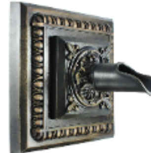
Oak Leaf Scupper with Apollo Back Plate Square in Oil Rubbed Bronze