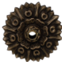
Versailles Emitter in Oil Rubbed Bronze with Bold Highlight

All emitters from Black Oak Foundry feature solid copper, brass, and bronze construction featuring food grade solder and brazing materials, allowing for use around your family, pets and fish pond applications.