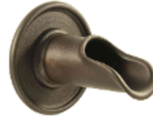
Classic Roman Scupper in Oil Rubbed Bronze

All short and medium length scuppers from Black Oak Foundry feature solid copper, brass and bronze construction featuring food grade solder and brazing materials, allowing for use around your family, pets and fish pond applications.