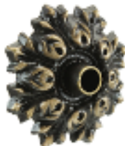
Bordeaux Emitter in Oil Rubbed Bronze with Extreme Highlight