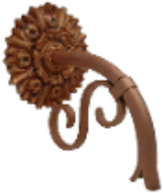
Versailles Spout in Penny Copper