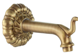
Viareggio Spout Swirl in Antique Brass

Crafted in Italy, our authentic Italian spouts feature solid brass construction and the quality you have come to expect from Black Oak Foundry. These spouts are made from 100% solid brass and can be customized in any of our metal finishes.