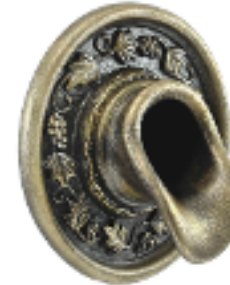
Napa Scupper in Oil Rubbed Bronze with Bold Highlight