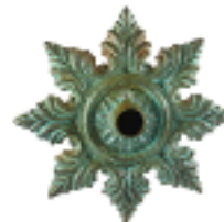
Normandy Emitter in Sealed Verde