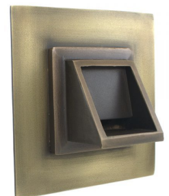
Short Square Scupper with Square Back Plate in Antique Brass American aka 'Old'

For a complete version of the Catalog, Additional Pictures, and other Resources, please visit BlackOakFoundry.com/Resources-and-Tools