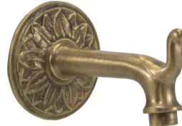
Chianti Spout in Antique Brass