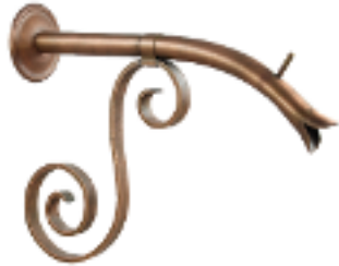
Large Courtyard Spout with Florentine in Brushed Copper